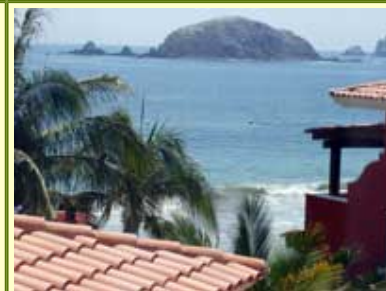
Upstairs 2nd Balcony View North