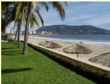
Ixtapas Main Beach

This furnished upper level - 2 Story vacation condo with 2 bedrooms and 2 baths is located on the best end of Ixtapa Mexico's main beach. It's away from the huge hotels, however its within walking distance or a short bus or taxi ride to the large hotels. A bus can be caught across the small parking lot from the Ixtapa Iguana's entrance, which only costs 50 cents U.S. to anywhere in Ixtapa and only 70 cents to go into Zihuatanejo. The bus runs about every ten minutes. The world class Ixtapa Marina with many wonderful restaurants is also just across the parking lot from the Ixtapa Iguana. It's a great place to dine and wander around in the evening. There are also a couple of little stores located in the marina. I don't golf (yet) , but the beautiful Ixtapa golf course is just a short walk away.