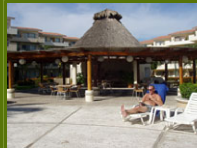
Priv. Restaurant & Bar