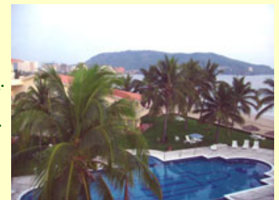
Upstairs Bedroom View

Two days of housekeeping a week are included. The maximum occupancy is 6 people - sorry, no pets allowed anywhere in the complex. I have to say, I've stayed at some of the hotels on Ixtapa's beach, and while they are nice, they get so crowded with hundreds of people vying for lounge chairs, screaming kids and the like. The Iguana on the other hand has a calm and relaxing atmosphere. It really is nice. If you have any questions please feel free to e-mail us .